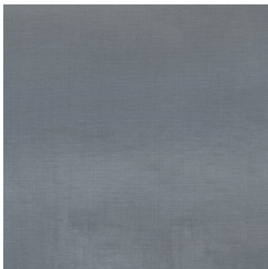
Aurora Blue - BB- NL-08