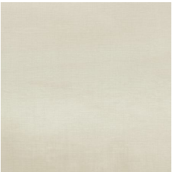
Cream Corona - BB- NL-06