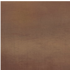
Aglow - BB-NL-06