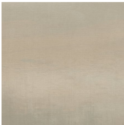
Atmospheric Beige - BB-NL-05