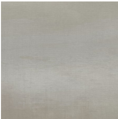
Grey Haze - BB-NL-02