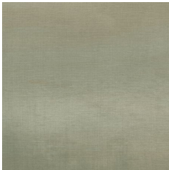
Magnetic Green - BB- NL-07