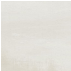
Artic White - BB-NL-01