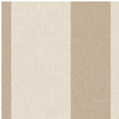
Sands - BM-MS-02