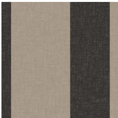
Dark Grotto - BM-MS-04