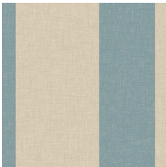
Island Blue - BM-MS-08