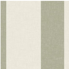
Sage Pearl - BM-MS-07