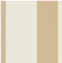
Warm Pearl - BM-MS-06