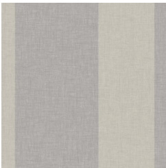
Alloy - BM-MS-03