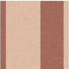
Magnolia Bud - BM-MS-05