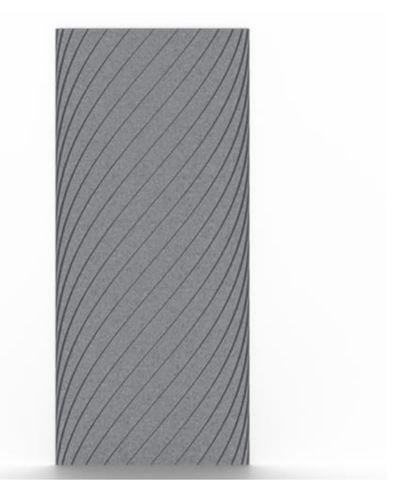
Etch Panel Verge Detail