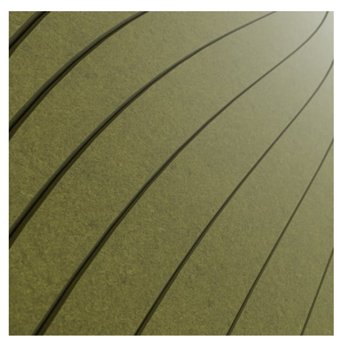
Etch Panel Verge Detail - Olive