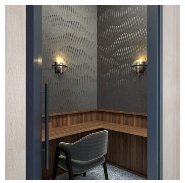
Etch Panel Topo