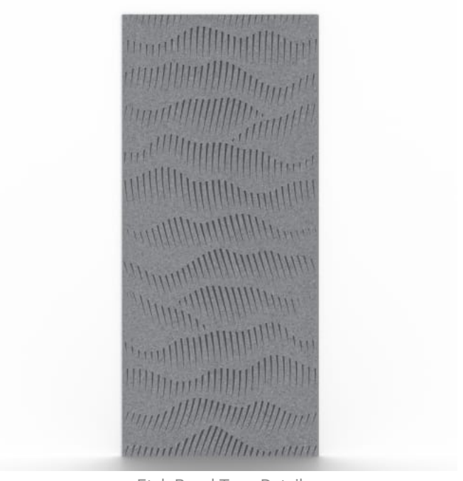
Etch Panel Topo Detail