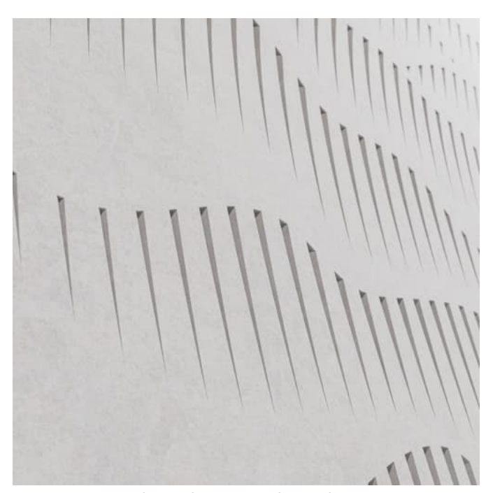
Etch Panel Topo Detail - Parchment