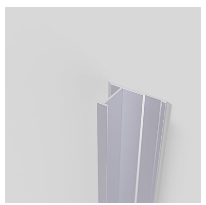
Joiner Trim Detail