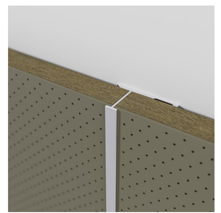
Joiner Trim Install Detail