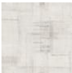
ABS02-006 DAPPLED LIGHT