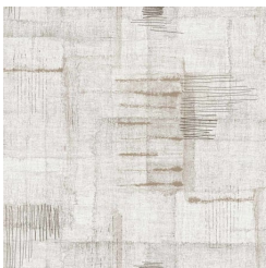
ABS02-024 AL FRESCO