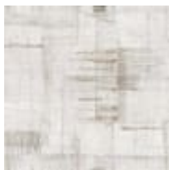
ABS02-024 AL FRESCO