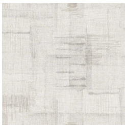
ABS02-006 DAPPLED LIGHT