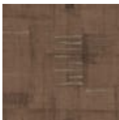
ABS02-497 VINTAGE TOUCH