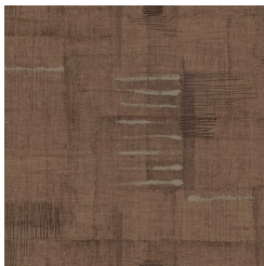
ABS02-497 VINTAGE TOUCH