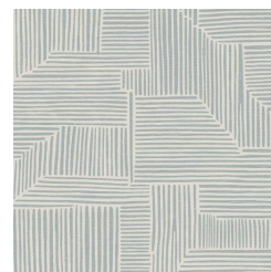
ABS03-336 NATURAL SPRING