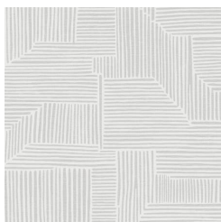
ABS03-061 COLD FOAM