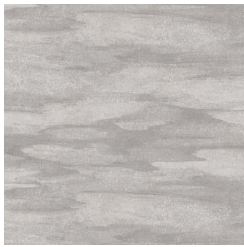
SP81-07 MAJOR GREY