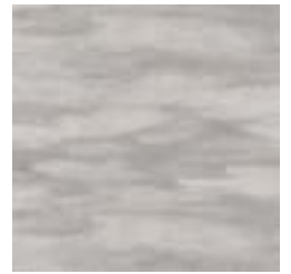
SP81-07 MAJOR GREY