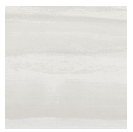
AZ53824 PEARL GREY