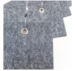
Baffle Systems Grommet Detail