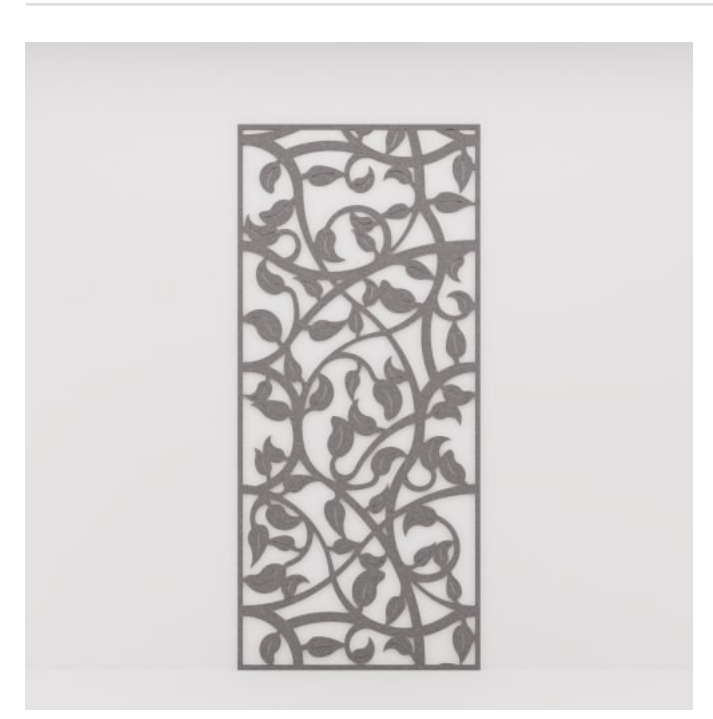
Pattern Panel Malini Detail