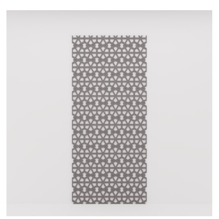
Pattern Panel Kali Detail