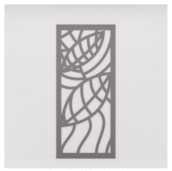
Pattern Panel Foliage B Detail