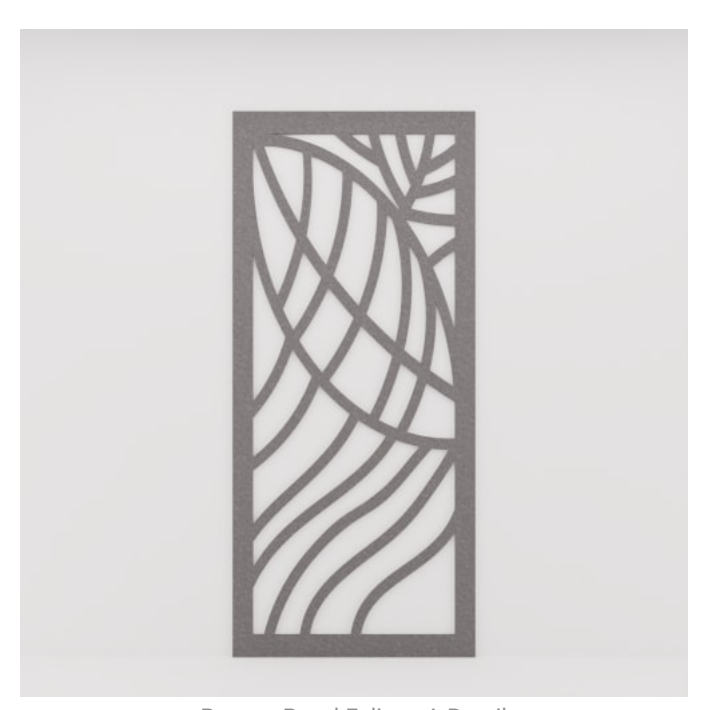
Pattern Panel Foliage A Detail