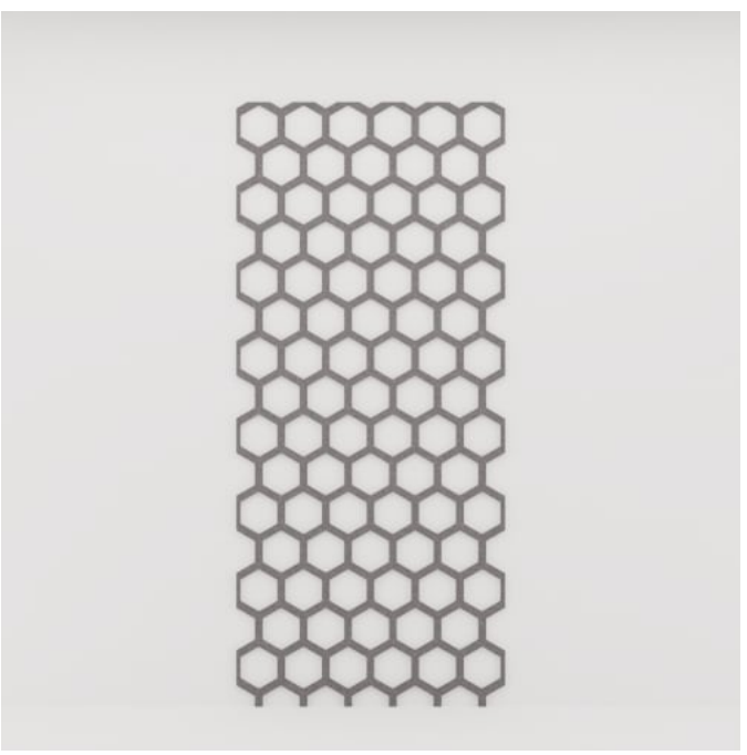
Pattern Panel Asiatic Detail