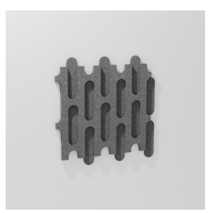
Pattern Tile Surge Detail