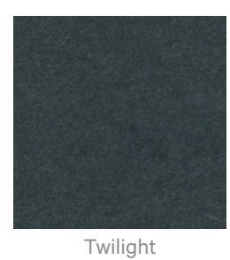
Zintra Timber Print