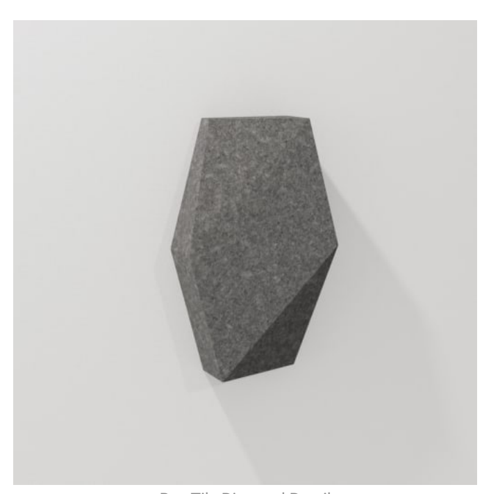
Box Tile Diamond Detail