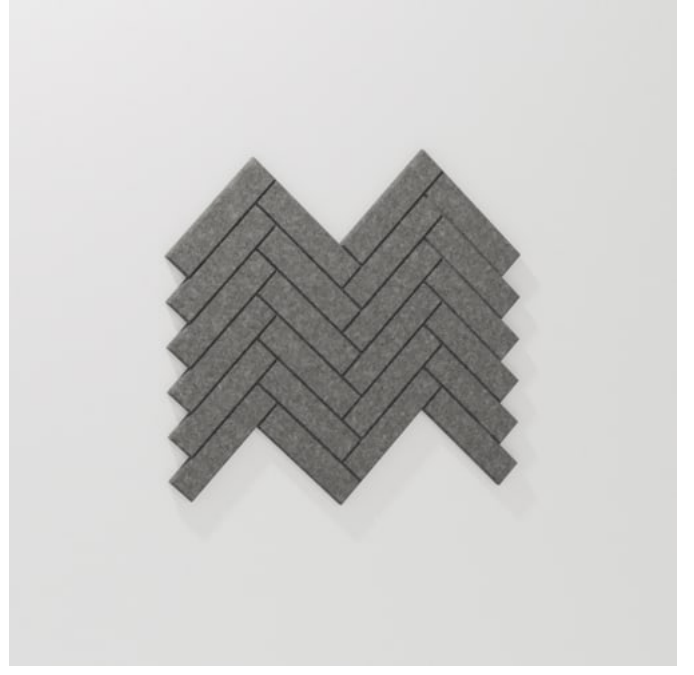
Etch Tiles Herringbone Detail