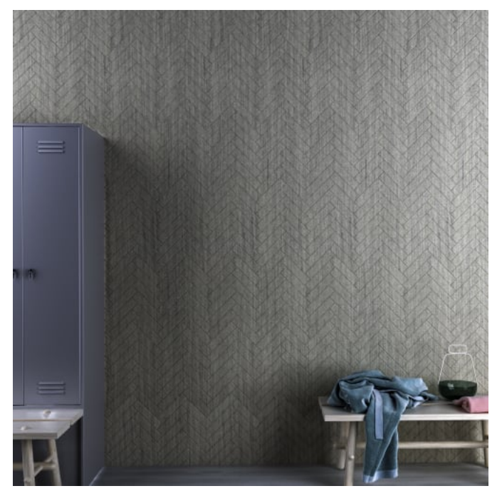
Etch Tiles Herringbone