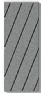
Etch Tiles Crossbar A Detail