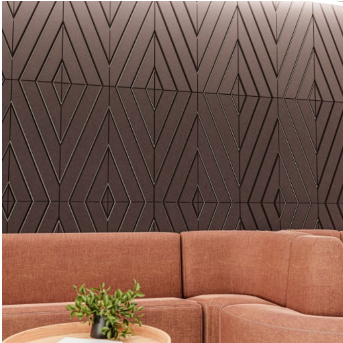
Etch Tiles Crossbar Detail