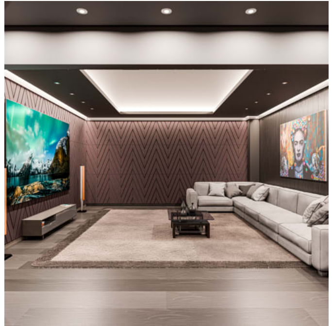
Etch Tiles Crossbar Twilight Pewter