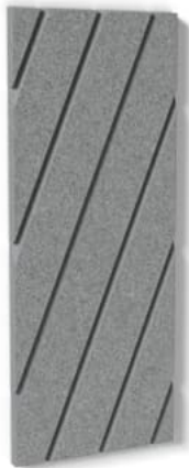
Etch Tiles Crossbar A Detail 2