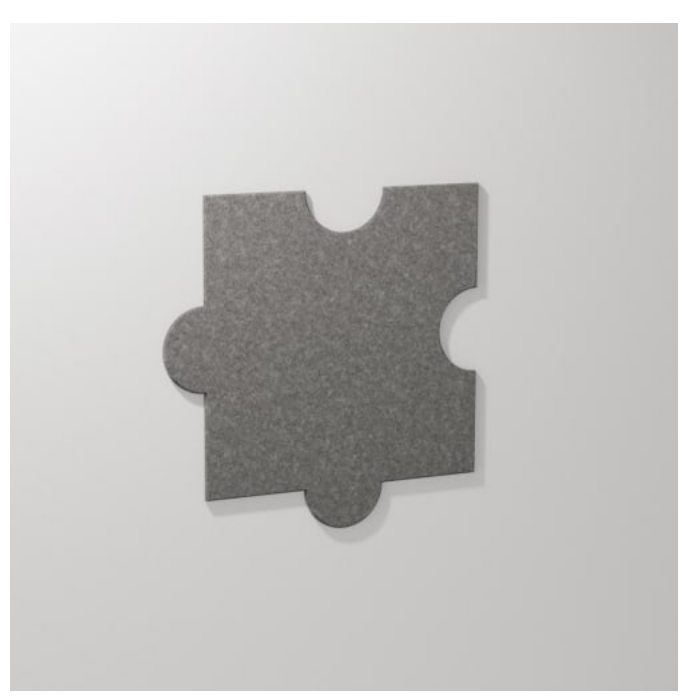
Plain Tile Jigsaw Detail