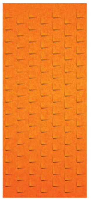
Texture Diamont Panel