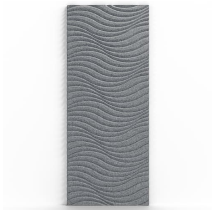
Emboss Panel Tidal Detail