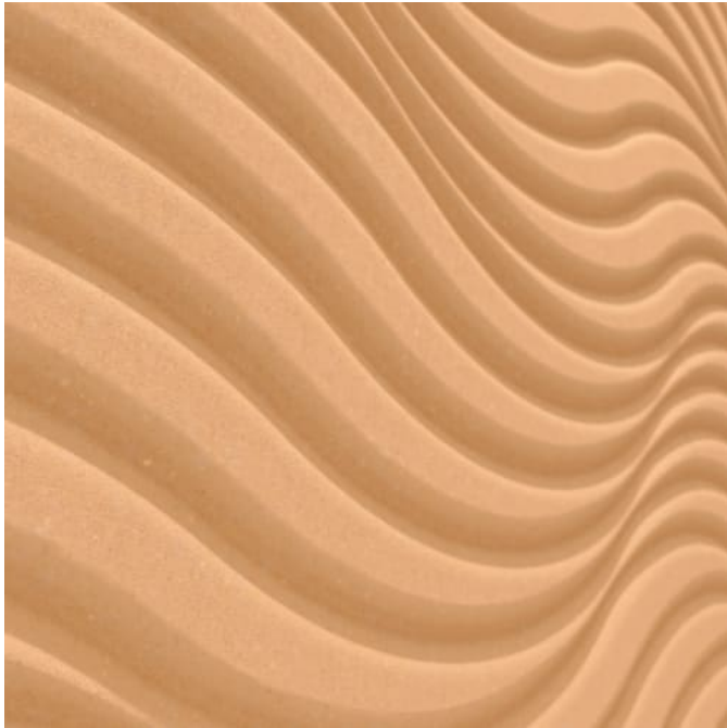
Emboss Panel Tidal Ecru Detail