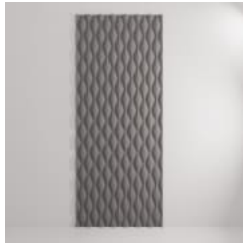
Emboss Panel Sandglass Detail