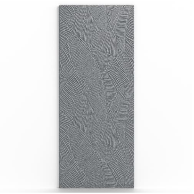
Emboss Panel Jungle Detail