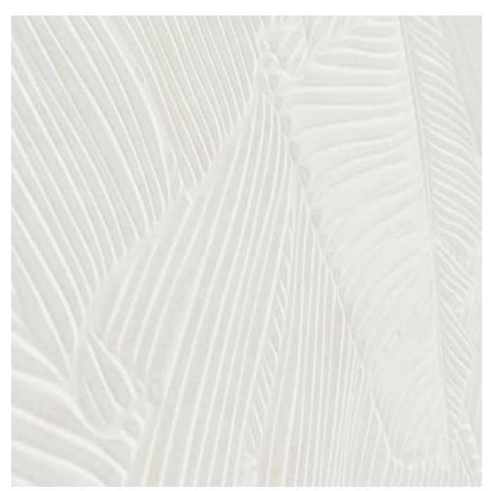
Emboss Panel Jungle Detail Ivory