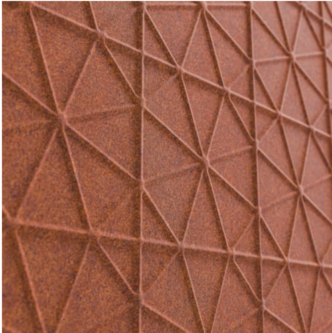
Emboss Panel Constellation Detail Brick