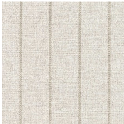
SI21-06 HOLLAND STRIPE