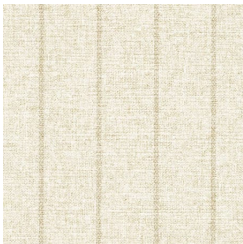
SI21-02 FLAXEN STRIPE