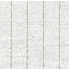
SI21-05 LINUM STRIPE