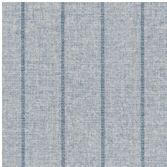
SI20-07 ANGORA STRIPE