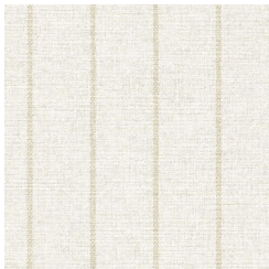
SI21-01 LOOM STRIPE