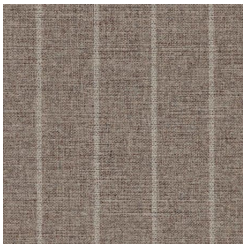
SI21-04 MOHAIR STRIPE