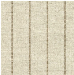
SI21-03 OATMEAL STRIPE