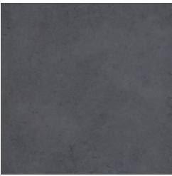
CONCRETE DARK TINT