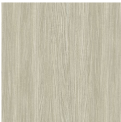
A212-831 WINTER BRANCH