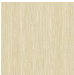
A212-122 SUGAR PINE