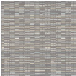
BNK 10 PEWTER