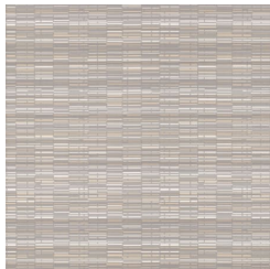
BNK 11 GHOST