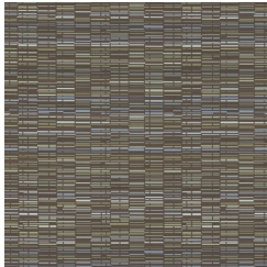
BNK 18 LOAM