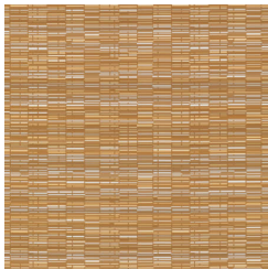
BNK 12 AMBER