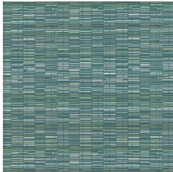
BNK 15 VIRIDIAN