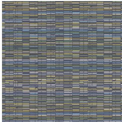
BNK 19 REGENT