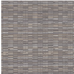
BNK 14 BASALT