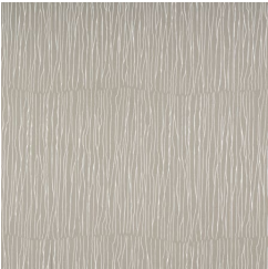
SG200-6 STONE WALL