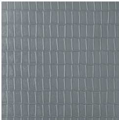
SG19-12 SLATE BLUE