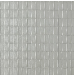
SG19-10 GRANITE GRAY