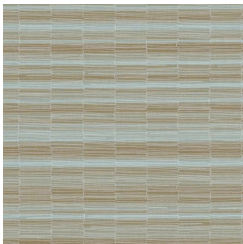
FRQ 23 SEASHORE