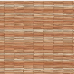
FRQ 24 COPPER