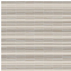
FRQ 20 IONIC