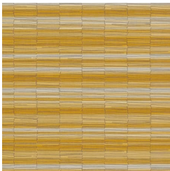
FRQ 21 TOPAZ