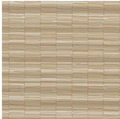
FRQ 25 GINGERSNAP