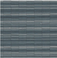
FRQ 29 NAUTICAL