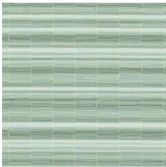
FRQ 22 CELADON