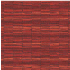
FRQ 27 SANGRIA