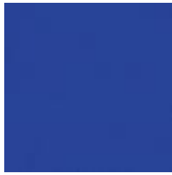
GEOQU3003 LAKE BLUE