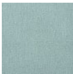
251 EAU DE NILE