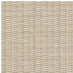
W2-WP-04 CANYON VIEW