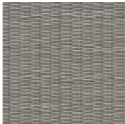
W2-WP-12 SLATE GREY