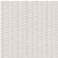
W2-WP-10 SILVER GRASS