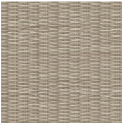
W2-WP-05 WATER REED