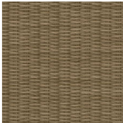
W2-WP-09 RAW UMBER