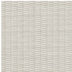
W2-WP-06 COTTON BREEZE