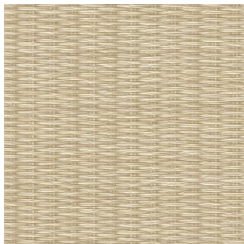
W2-WP-01 WHEAT FIELD