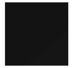
Core Powder-Coat Black Satin