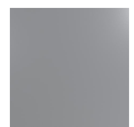
Core Powder-Coat Silver Pearl Satin Metallic