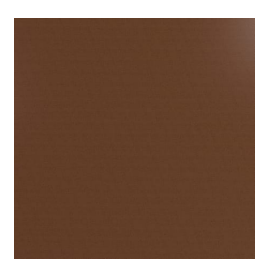
Core Powder-Coat Coreten Textured