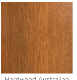
Hardwood Australian Eucalyptus Light Oil