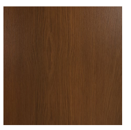
Hardwood Australian Eucalyptus Dark Oil