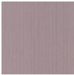
ST101144P STONE LOTUS