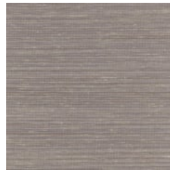
SN101148P DRIED PLUMS