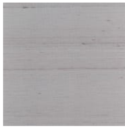
ST101146P SEDUM PURPUREUM