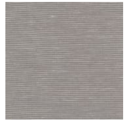
SN101149P BLACK CURRANT