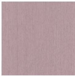
ST101139P ENKIANTHUS FLOWER