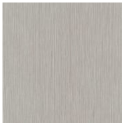
ST101136P PINKISH GRAY