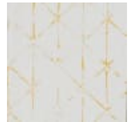
BB-GE-09 HAVISHAM'S SUN