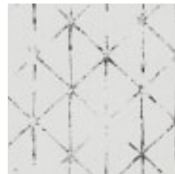
BB-GE-08 WHIMPLE WHITE