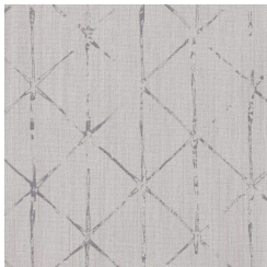
BB-GE-04 SILVER FILE