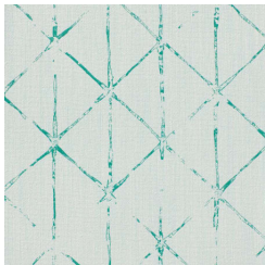
BB-GE-01 GARGERY GREEN