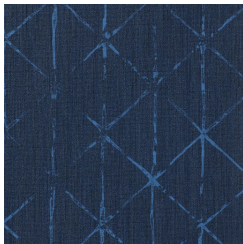
BB-GE-03 SHADOW NAVY