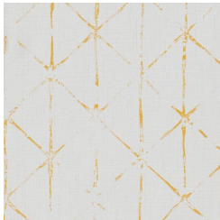
BB-GE-09 HAVISHAM'S SUN