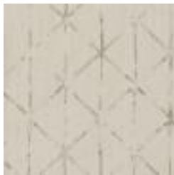
BB-GE-06 HONORABLE CREAM