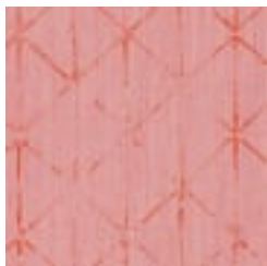
BB-GE-10 PIP'S PINK