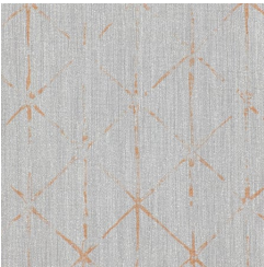
BB-GE-05 FORGE GREY