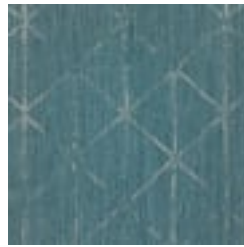
BB-GE-02 BLUE BOAR