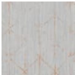
BB-GE-05 FORGE GREY