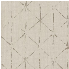
BB-GE-06 HONORABLE CREAM