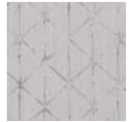
BB-GE-04 SILVER FILE