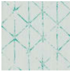
BB-GE-01 GARGERY GREEN