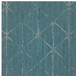
BB-GE-02 BLUE BOAR