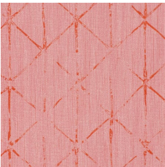
BB-GE-10 PIP'S PINK