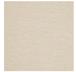
AZ51196 MARBLED WHITE