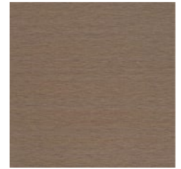
AZ51212 PLUM BRANCH