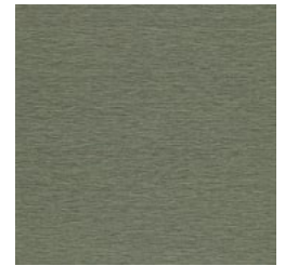
AZ53009 PINE NEEDLE