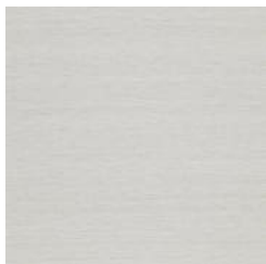
AZ53010 ANTIQUE IVORY