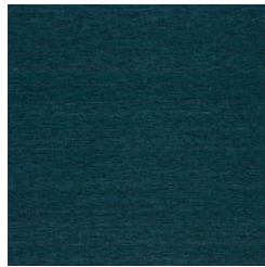
AZ53006 TROPIC NIGHT