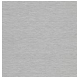
AZ53001 FULL MOON