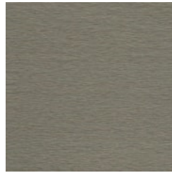
AZ51208 BLACKENED TEAL