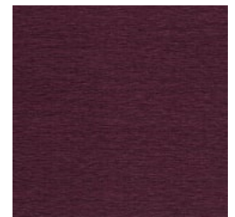
AZ53014 DEEP ORCHID