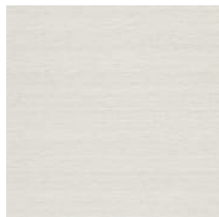
AZ53011 WARM GLOW