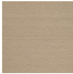
AZ51192 BURNISHED TAUPE