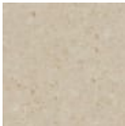
AZ53410 IVORY CREAM