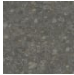
AZ53407 MARVEL GREY