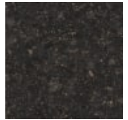
AZ53408 BLACK MARBLE