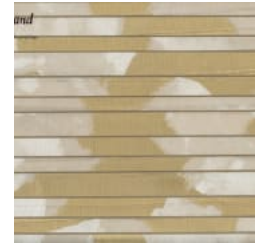
G0102HJ6073 AMBER GOLD