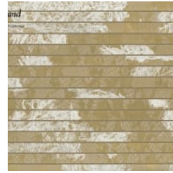
G0102HJ6072 GINKGO BILOBA YELLOW