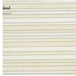
G0102HJ6071 PEAR WHITE