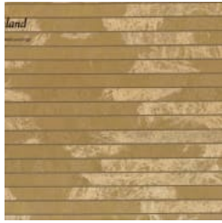
G0102HJ6070 SPRUCE YELLOW