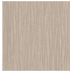
BX4383 FLOW CHIC