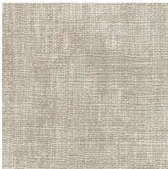
7022-31 ALL ACCESS