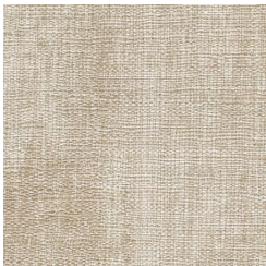
7022-33 NAKED TRUTH