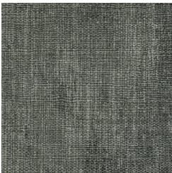
7022-98 HEAVY METAL