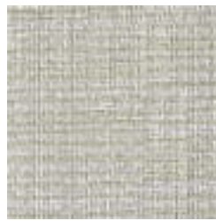
W2-TT-13 COOL STONE