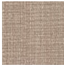
W2-TT-08 HAZY TAUPE