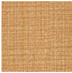
W2-TT-02 SPICED CIDER