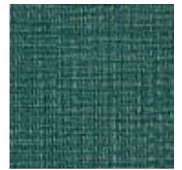
W2-TT-15 RAINY SKY