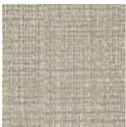
W2-TT-16 WET MOSS