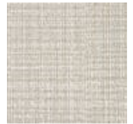
W2-TT-10 WOVEN WHITE