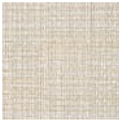
W2-TT-07 ANTIQUE CLAY