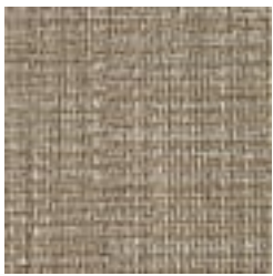
W2-TT-11 TREE BARK