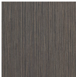
W2-SB-06 SATIN SLATE