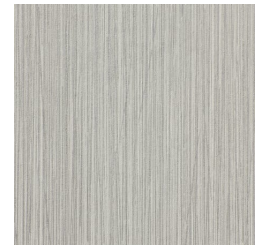
W2-SB-04 SILVERY FROST