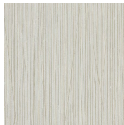
W2-SB-07 WARM & CLOUDY