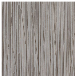
W2-SB-05 CINDER SHADOW