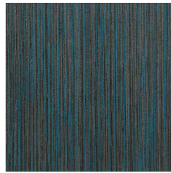
W2-SB-02 BLUE CARBON