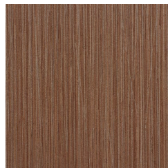
W2-SB-12 COCOA BUTTER