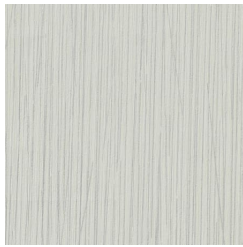
W2-SB-01 CLOUDY SHIMMER