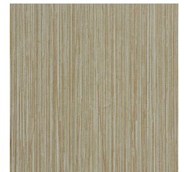
W2-SB-09 GOLDEN SAGE