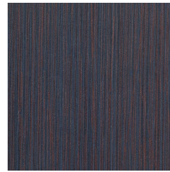
W2-SB-03 RUSTED NAVY