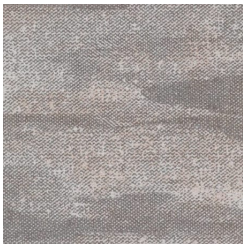
SP21-07 MAJOR GREY