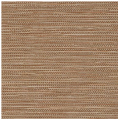
W2-PT-16 SWEET WOODRUFF