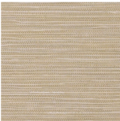
W2-PT-02 FOUNTAIN GRASS