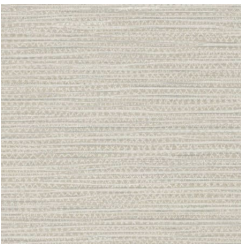
W2-PT-01 MORNING LIGHT