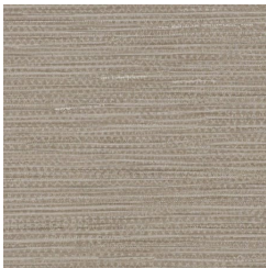
W2-PT-05 BLUE FLAX