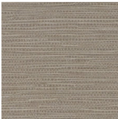
W2-PT-04 SILVER MOUND