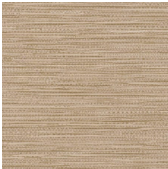
W2-PT-15 NATIVE GINGER