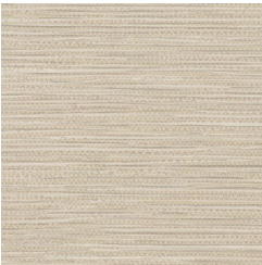
W2-PT-10 IVORY HEART