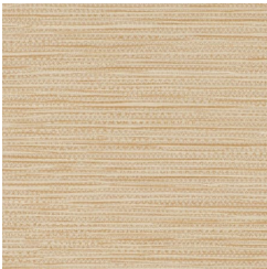
W2-PT-11 BUTTER AND SUGAR