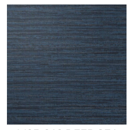
A195-342 DEEP SEA