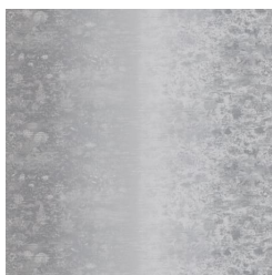
W2-PR-02 GRADIENT GREY