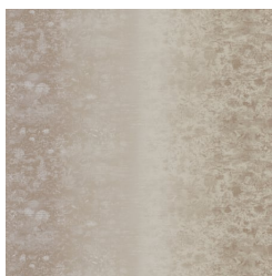
W2-PR-06 FADING FAWN