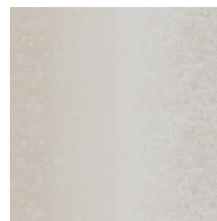
W2-PR-05 ELEGANT CREAM