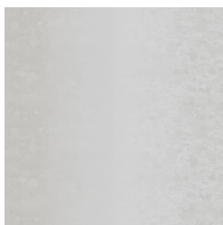
W2-PR-01 PICTURESQUE PEARL