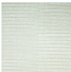
A132-153 MISSION ST