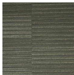
A132-383 GEARY BLVD