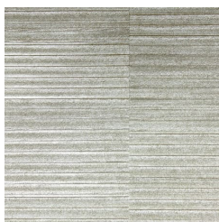
A132-584 BALBOA ST