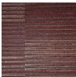
A132-345 NOB HILL