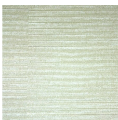
A132-868 BAY ST