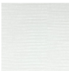
A132-891 PACIFIC HEIGHTS