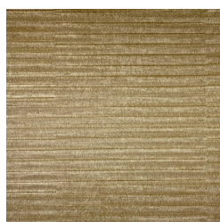
A132-855 VAN NESS AVE