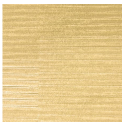
A132-570 JACKSON SQ