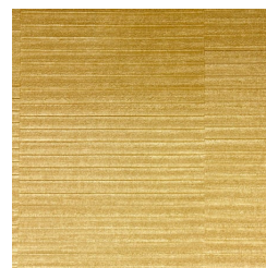
A132-712 CALIFORNIA ST