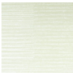
A132-127 PORTERO AVE