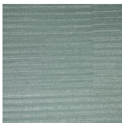
A132-320 MARINA BLVD