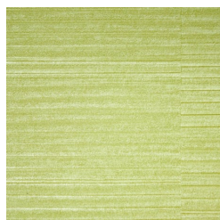
A132-200 PRESIDIO BLVD