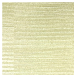
A132-194 RINCON HILL