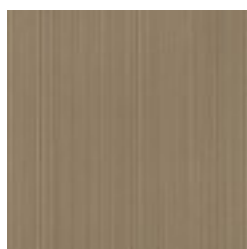
W2-LN-06 OILED BRASS