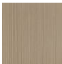
W2-LN-09 RAW SUGAR