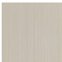
W2-LN-11 BONE WHITE