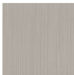
W2-LN-14 SILVER WASH