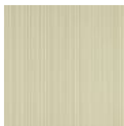
W2-LN-04 FRESH PEAR