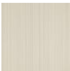
W2-LN-07 WINTER IVORY