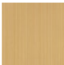
W2-LN-01 SUN SHOWER