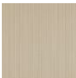
W2-LN-08 ROYAL CREAM