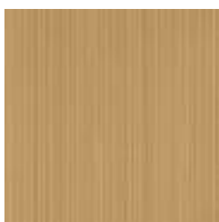
W2-LN-02 EGYPTIAN GOLD