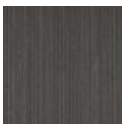
W2-LN-18 PEWTER GREY