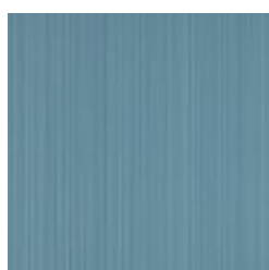
W2-LN-16 CLEAR BLUE